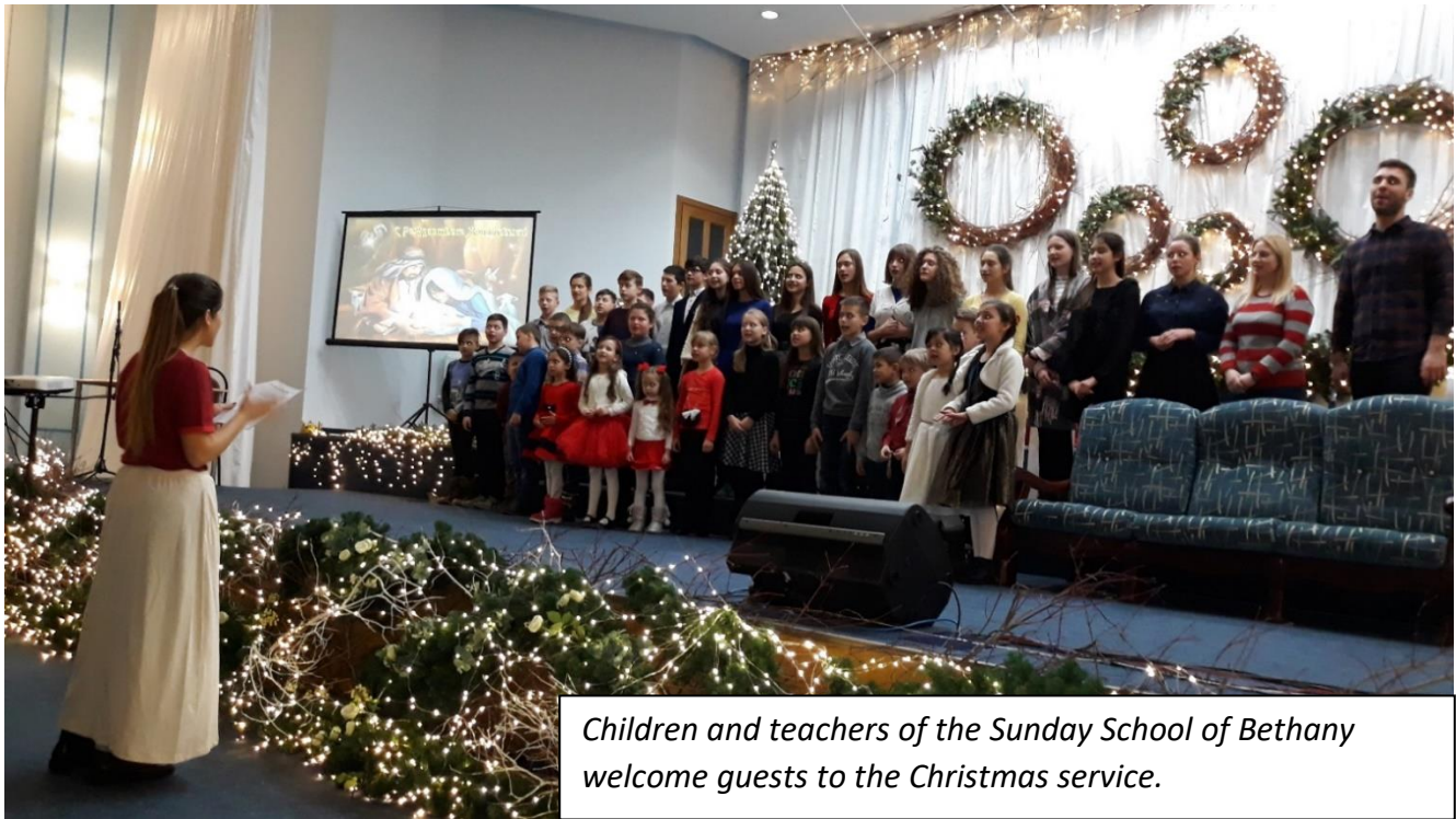
Children and teachers of the Sunday School of Bethany welcome guests to the Christmas service.