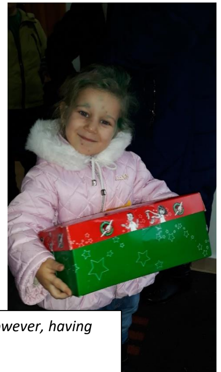
This girl was very naughty during the service. However, having received a gift, she calmed down and smiled.